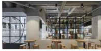
Impressive Modern Italian Restaurants