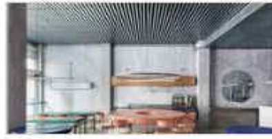
Art-Inspired Industrial Restaurants