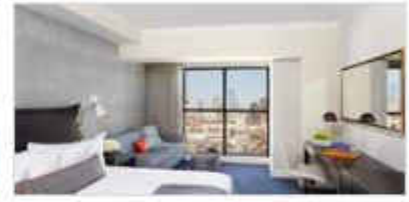
Hip Music Venue Hotels