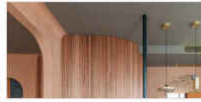
Mediterranean-Inspired Restaurant Interiors