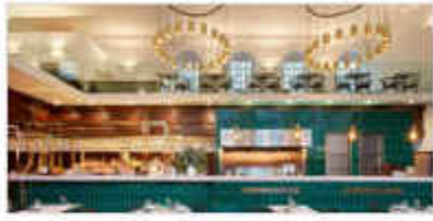
60s-Inspired Restaurant Decors