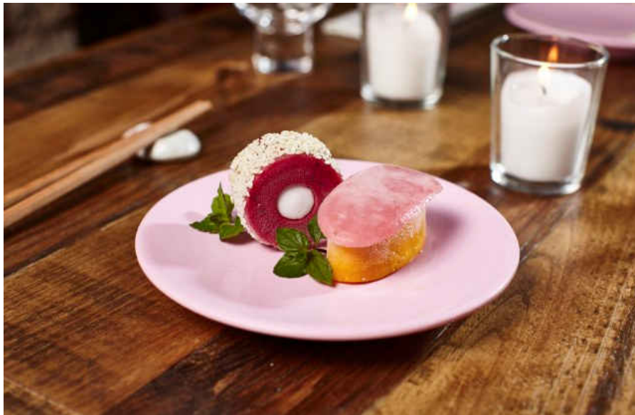
A dessert at Shimokita.